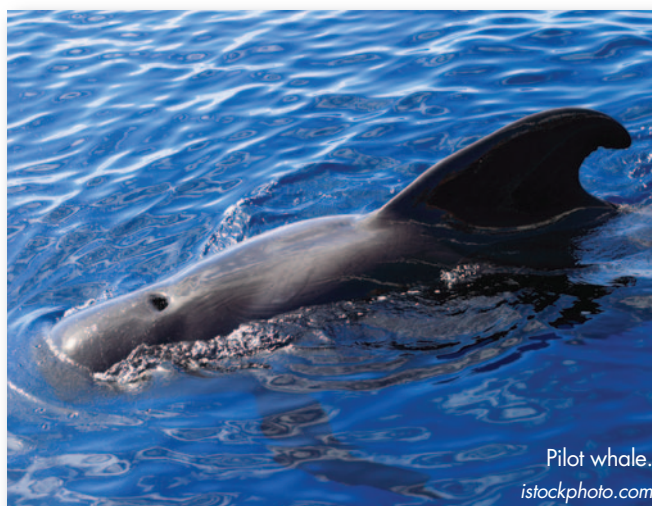
Pilot whale.

The next IPR will be held 14–16 January 2014 at EXWC in Port Hueneme, California.