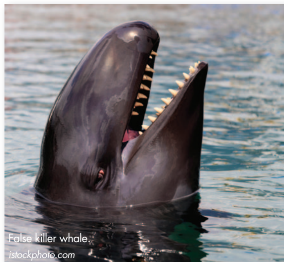
False killer whale.

Until then, look for the upcoming Currents article entitled “Sonobuoys Play Valuable Role in Marine Mammal Research and Monitoring: LMR Program Reviews Requests & Recommends Allocations to Support Ongoing Monitoring and Research Efforts.” The article discusses how a portion of the Navy sonobuoy allocation plays an important role in marine mammal research and conservation monitoring every year. It also summarizes why the LMRAC was the natural choice for identifying top priority requests and helping the Sonobuoy Liaison Working Group and its staff effect the transfer of sonobuoys to selected users, both within and outside Navy. Look for other articles about the LMR program’s accomplishments in upcoming issues of Currents , the Navy’s energy and environmental magazine. You can read Currents on-line and subscribe to the magazine at http://greenfleet.dodlive.mil/currents-magazine .